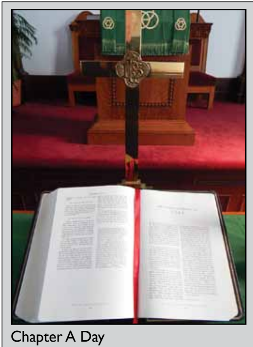
Chapter A Day

We are going to read through the Bible together one chapter at a time. Every Most :0) mornings an email will pop into your inbox with some background information about today's chapter and ... a tweet from Jana Riess' "The Twible: All the Chapters of the Bible in 140 Characters or Less."